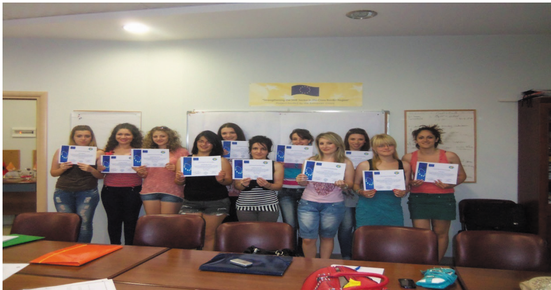
English language course