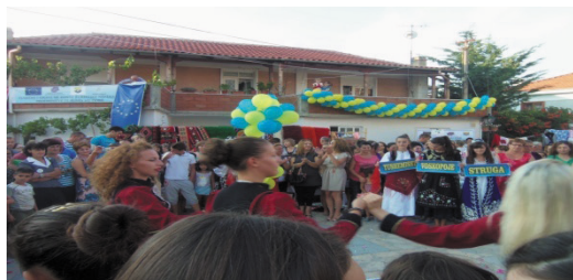
Opening ceremony –Tushemisht Fair