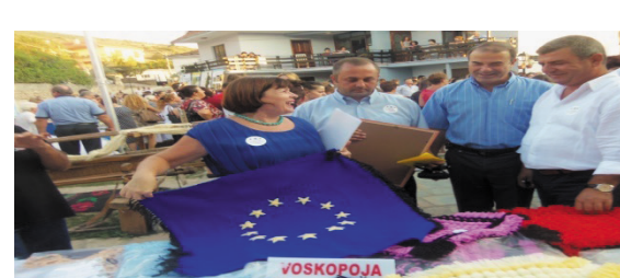
Head of Tushemisht Commune visiting the Fair