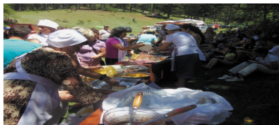
Gastronomic dishes in Voskopoja Fair