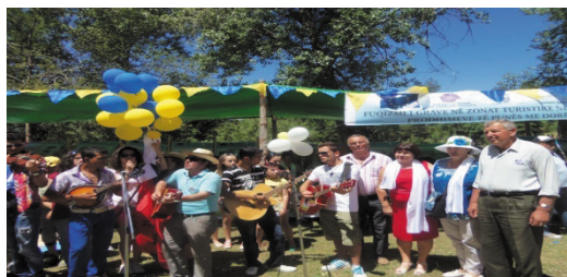
Musical Group-Voskopoja Fair