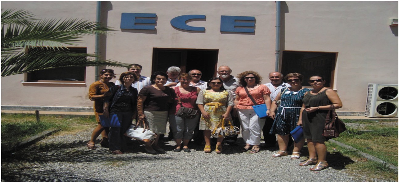
Elbasan meeting of VET schools principals